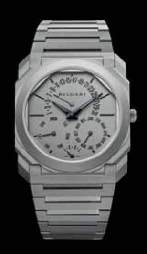
Aiguille d'Or 2021 - Bulgari Octo Finissimo

The Aiguille d'Or Grand Prize: Bulgari, Octo Finissimo